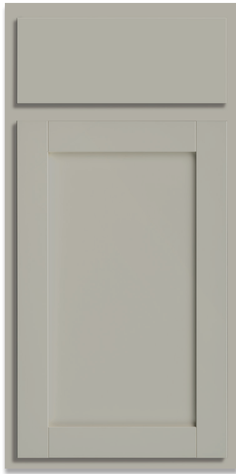
Door Style: McDurmon Wood Type: Laminate Finish: Grey